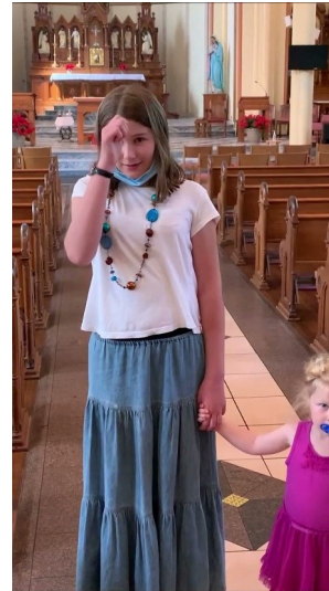
Sign before the Gospel

We wrote and illustrated stories of Jesus' birth. For more photos and videos of our Family Faith Formation sessions go to allsaintsevansville.org Click on the Youth tab then choose Family Faith Formation 2020-2021