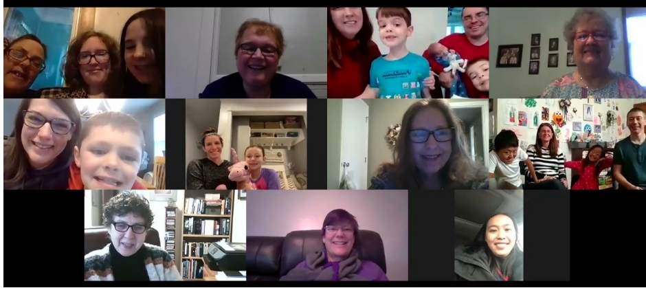
Family Faith Formation continues to meet virtually using Zoom

Students made video clips to teach others how we practice our faith.