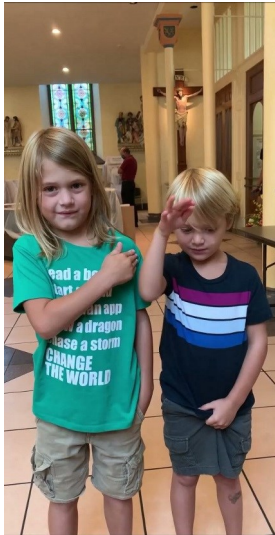
Sign of the Cross

Students made video clips to teach others how we practice our faith.