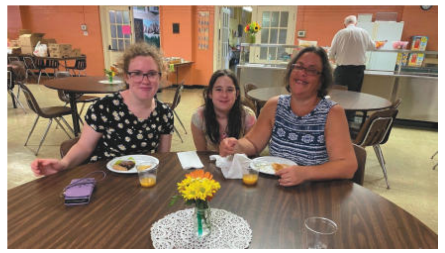
Celebrating with our Parish Family

SA—Hearing assistance is available. Ask any member of the Parish Team.