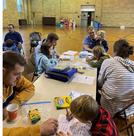
We learn more about Deborah who was a prophet and judge.

Celebrate with us at the 10:30 am Mass on Sunday, May 29th at St. Anthony Church.