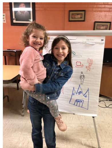
Students were very creative with their drawings for our First Communion picture review game.