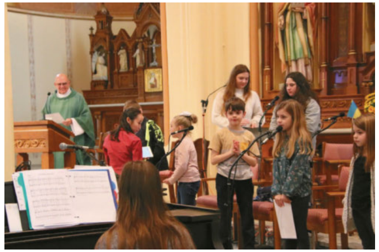
Children's Choir Sunday, January 29